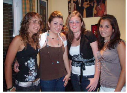
Exchange students develop friendships with their host families. These friendships can span continents and last a lifetime.

insurance, which can range from $1,500 to $2,000 depending on the destination, and any additional entertainment and emergency funding based on their parents' discretion. In previous years, an allowance of $200 to $500 has been sufficient.