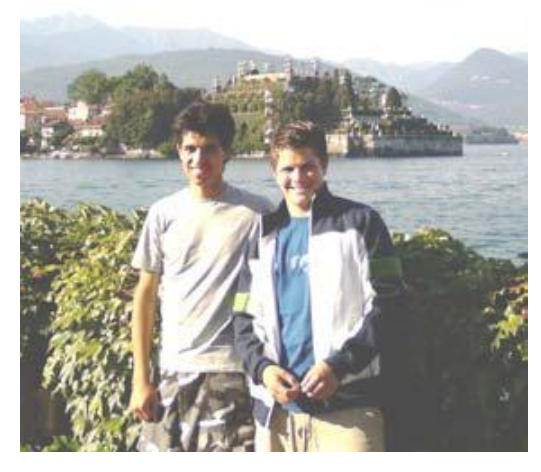
Another beautiful day in Stresa Italy, with Lago (Lake) Maggiore and Isola (Island) Bella in the background.

Selected candidates are then recommended for District level interviews. Application dates vary as do deadlines for fees. For more information and for application deadlines, call Burton Blackmar at 678-267-0203 or email him at <u>Burton@Blackmar.us</u>. Visit the website at <u>www.rotarydistrict6910.org</u>