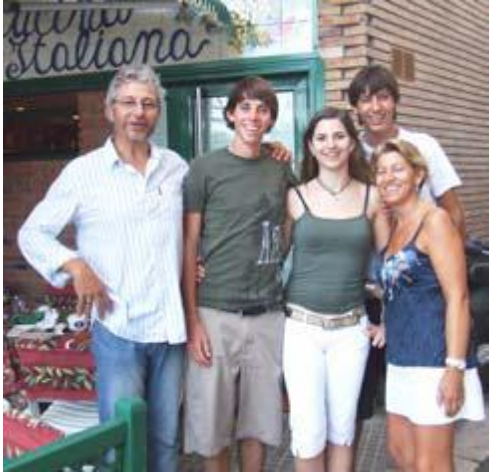
Youth Exchange Students become part of their host Families.

The Rotary Youth Exchange Program is an amazing learning opportunity. The local program is open to students ages 15 to 19 who live or attend school in Rotary District 6910, which includes 65 clubs and more than 2,000 members in the North Georgia.